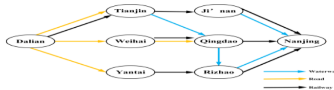
Figure 3: Transport Network

This paper constructs a multimodal transport network with Dalian as the starting point and Nanjing as the ending point, passing through six cities including Tianjin and Jinan. The network contains three modes of transport, namely road, rail and waterway, as shown in Figure 3.