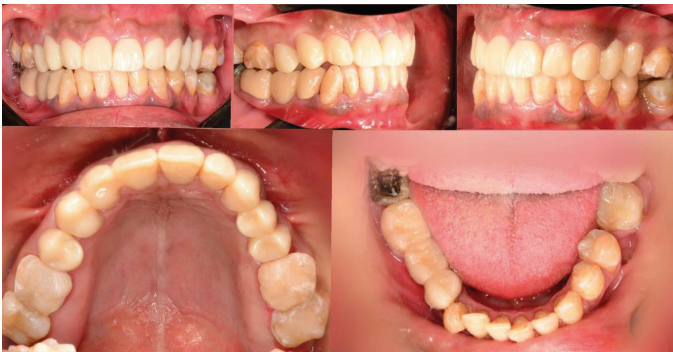
Fig. 4. Final insertion of fixed restorations

Phase IV: Maintenance and follow up was done by recalling the patient again at 1 week, 1 month, 3 months.