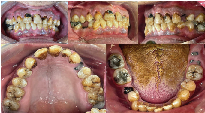
Fig. 1. Preoperative intraoral images

The preoperative condition of the maxillary and mandibular areas is shown in (Fig. 1). Following initial assessments and diagnosis with all required diagnostic tools (history, extraoral and intraoral examinations, mounted diagnostic casts, and radiographs) then the treatment plan was established.