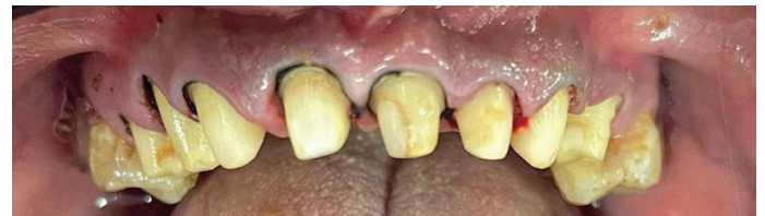
Fig. 3. Preparation and soft tissue retraction

Single 00 size retraction cord with a hemostatic agent was inserted into the sulcus to retract the soft tissue. Impressions were taken using heavy and light body polyvinyl siloxane (PVS) in a tray. An opposing impression was made with alginate and bilateral bite registrations were recorded with PVS (Fig. 3).